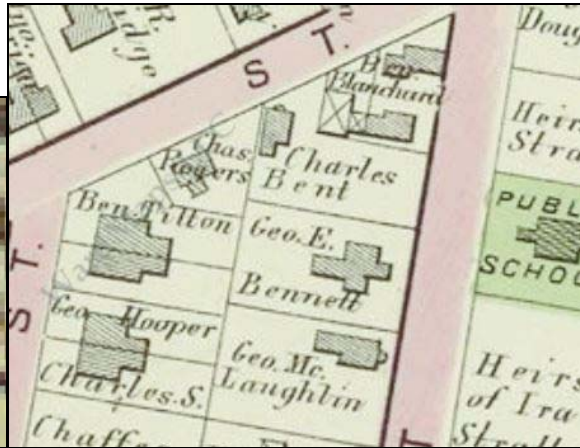
1874 Hopkins Plate E