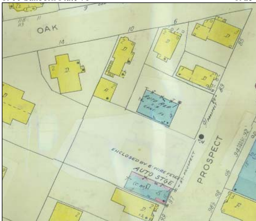
1958 Sanborn Plate 19