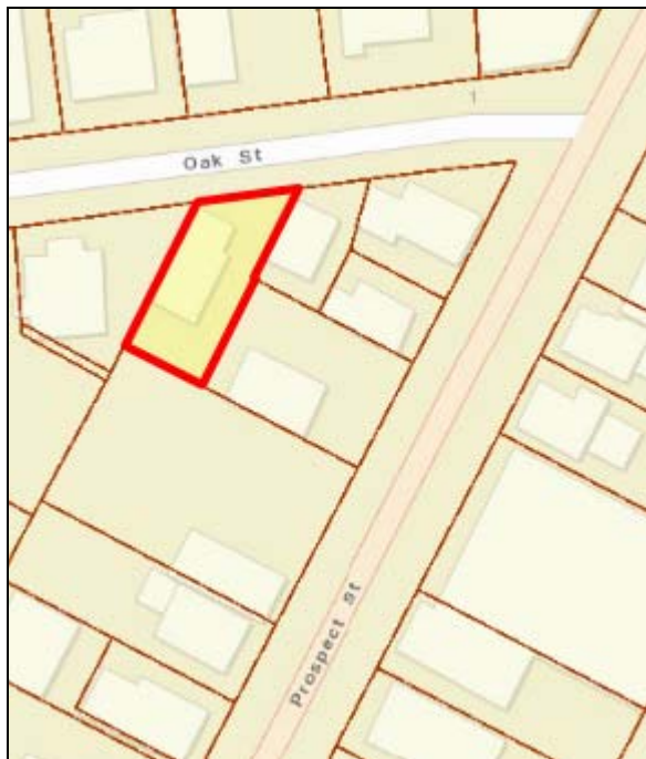
10 Oak Street

The subject building is NOT found historically and architecturally significant due to numerous alterations to the building and no associations with a reputed architect or builder.