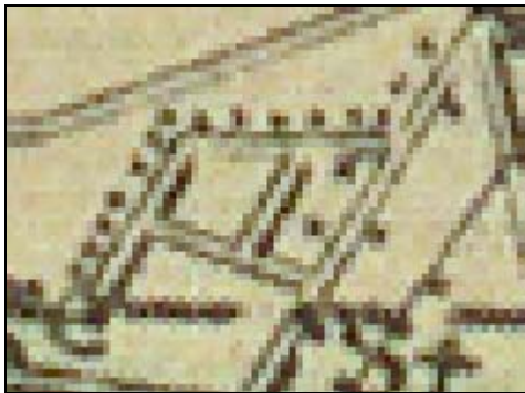
1860 Walling Map Detail