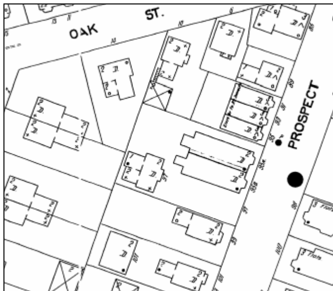
1900 Sanborn Plate 76